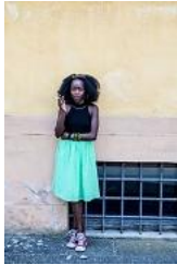
Black Portraiture[s] Conference, Florence, Italy, 2015