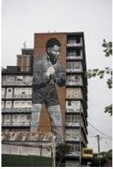
Mural of Nelson Mandela, Johannesburg, 2016