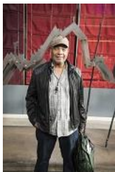
Emory Douglas, Johannesburg, 2016