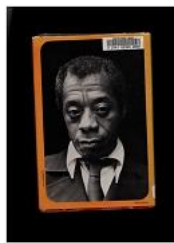
James Baldwin, back cover of "If Beale Street Could Talk," African American Library, Oakland, 2019