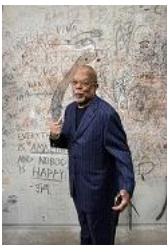
Henry Louis Gates, Jr., Black Portraiture[s]