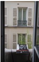
Room with a View - Basquiat, Paris, 2014