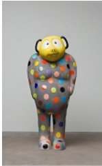
Untitled, Tanuki 2013 glazed raku ceramics 57" x 27" x 20¾"