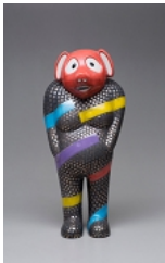
Untitled, Tanuki 2014 glazed raku ceramics 33" x 16" x 12"