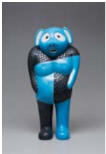
Untitled, Tanuki 2014 glazed raku ceramics 33" x 16" x 12"