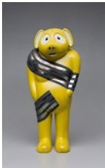
Untitled, Tanuki 2014 glazed raku ceramics 33" x 16" x 12"