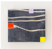
Untitled, Wall Slab 2015 glazed raku ceramics 30" x 24½" x 1½"