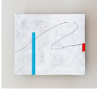
Untitled, Wall Slab 2015 glazed raku ceramics 24½" x 30" x 1½"