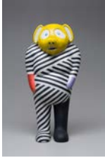
Untitled, Tanuki 2014 glazed raku ceramics 33" x 16" x 12"