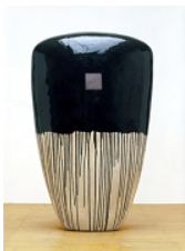
Untitled, Dango 2003 glazed ceramics 46" x 31" x 16"