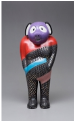
Untitled, Tanuki 2014 glazed raku ceramics 33" x 16" x 12"