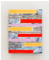
Untitled, Wall Slab 2015 glazed raku ceramics 30 x 24½" x 1½"