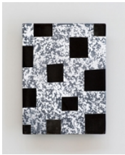
Untitled, Wall Slab 2015 glazed raku ceramics 30" x 24½" x 1½"