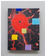
Untitled, Wall Slab 2014 glazed raku ceramics 30 x 24½" x 1½"