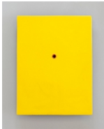
Untitled, Wall Slab 2013 glazed raku ceramics 30½" x 24½" x 1½"