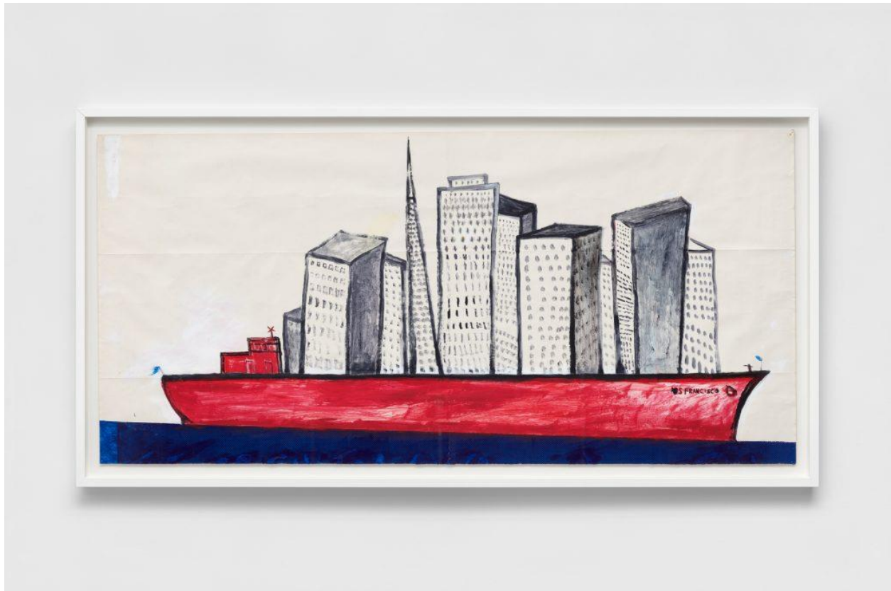
"S. Francisco," 1993, by Lawrence Ferlinghetti.