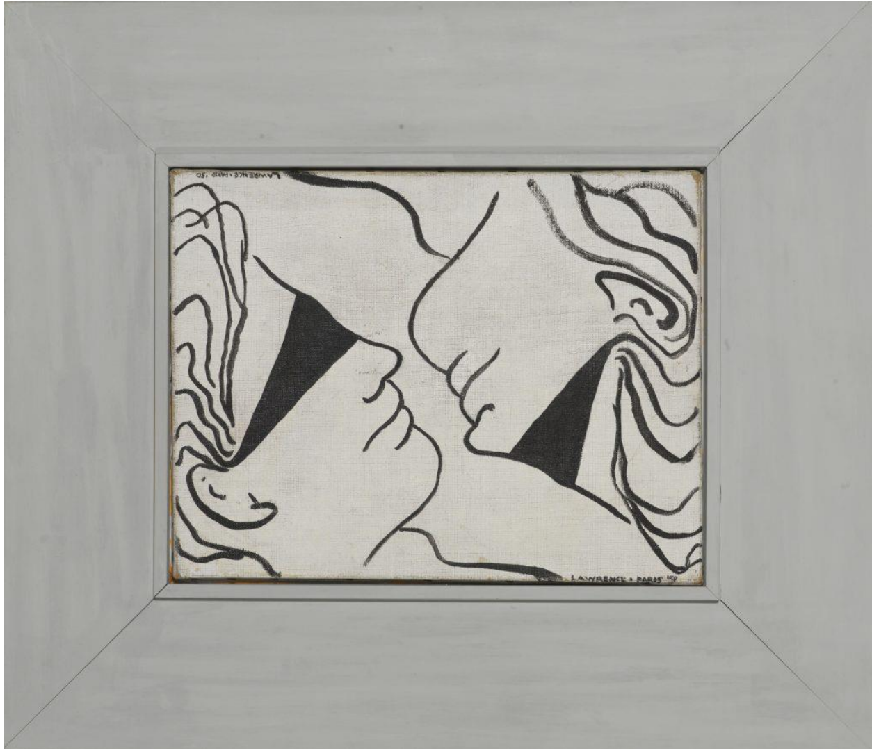
Lawrence Ferlinghetti, “Deux,” 1950.

What immediately caught her attention was the blindfolded couple in “Deux,” which was shown in the traveling exhibition “Beat Culture and the New America, 1950-1965” , mounted by the Whitney Museum of American Art in 1995. Painted in 1950, it is the earliest work in Ferlinghetti’s collection.