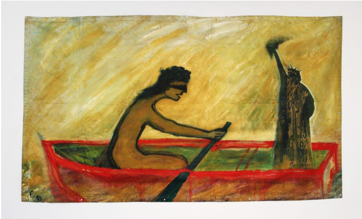
Lawrence Ferlinghetti, "Liberty #2," 1993.