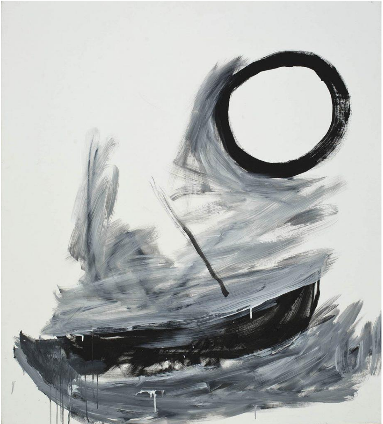
Lawrence Ferlinghetti, "Voyage II," 2016.

"Deux" sold on opening night, but still available is "Voyage II," completed in 2016. It is Ferlinghetti's final painting before he retired due to failing eyesight.