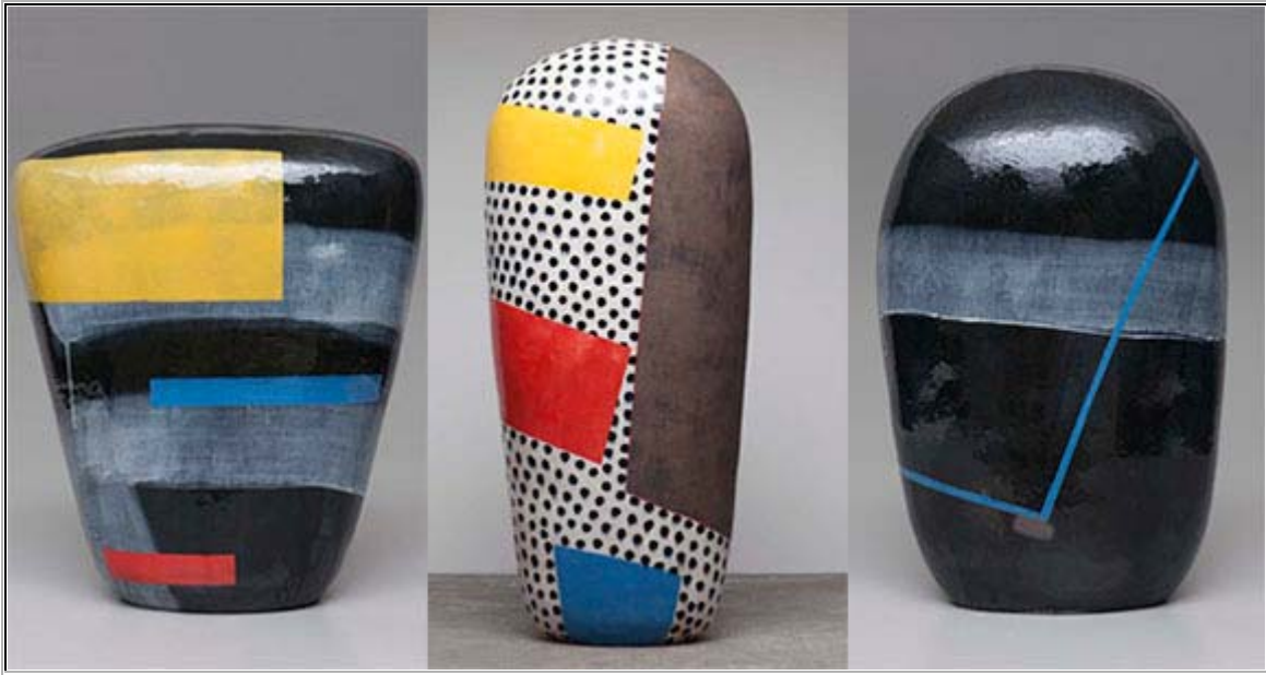
"Untitled Dangos", 2011-12, glazed ceramic, 23 x 20 x 11"; 73 x 33 x 22"; 25 x 17 x 11"

In a universe numbed by conflict and ideological posturing, the art of Jun Kaneko feels like a tonic. Renowned for the ceramic megaliths he calls dangos , and for his equally accomplished paintings, drawings, installations, glassworks and opera sets, Kaneko, like Matisse, seems drawn to the power of pattern.