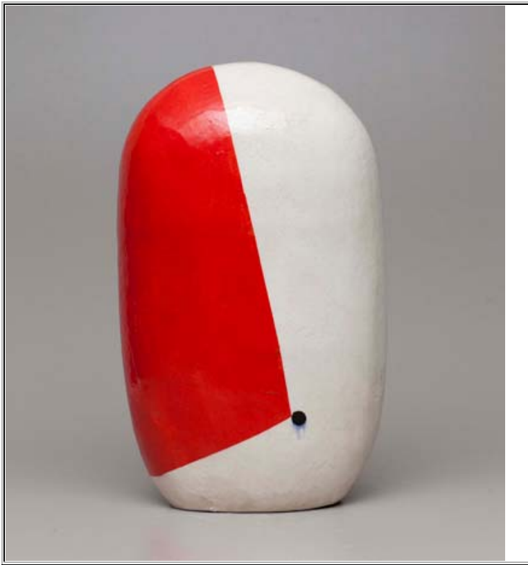
"Untitled Dango", 2012, glazed ceramic, 26 x 14 x 10"